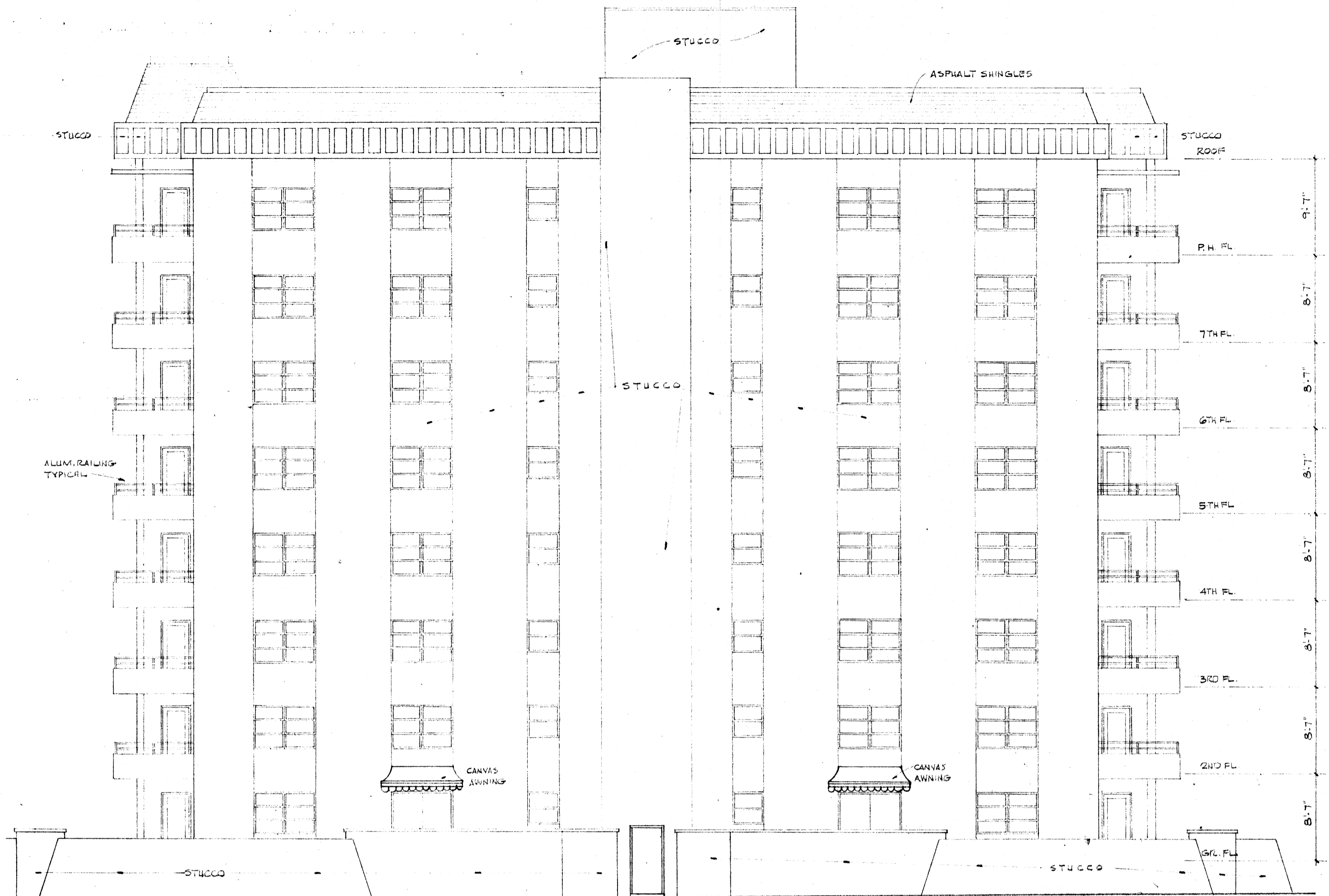
WEST ELEVATION - EAST ELEVATION SIMILAR SCALE 1/8" = 1'-0"